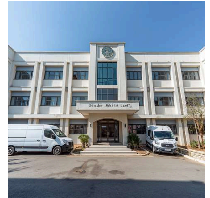
Hostel & Clinical Training