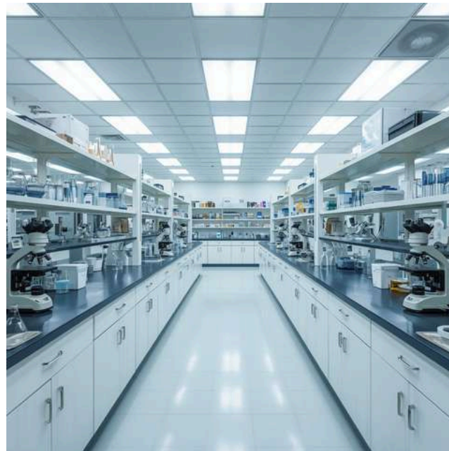
Laboratories & Classrooms